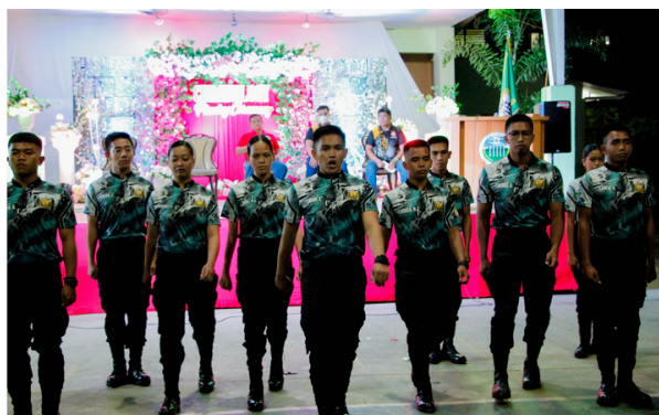
BY: ACEL JOY GONZALES

The pinning ceremony was not just a celebration of the students' achievements, but also a reminder of the responsibility they carry as they enter the realm of crime and justice.