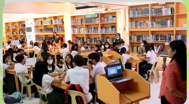
GALLEGAN QUIZ BEE