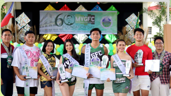
MR. and MS. INTRAMURALS