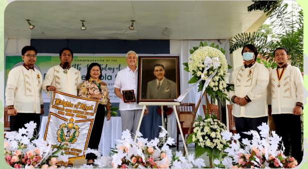
POSTHUMOUS AWARD FROM THE ORDER OF THE KNIGHTS OF RIZAL