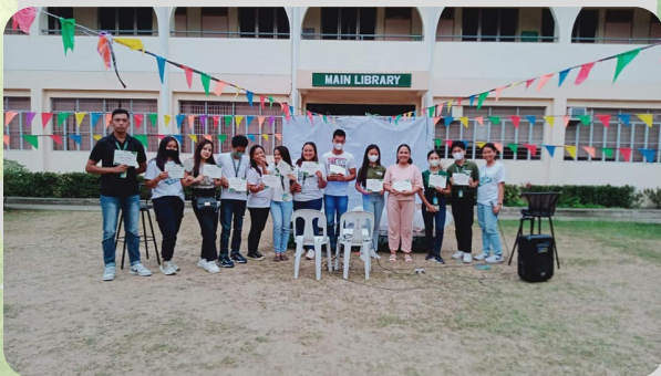
AWARDING OF CERTIFICATES