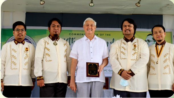
POSTHUMOUS AWARD FROM THE ORDER OF THE KNIGHTS OF RIZAL