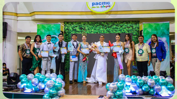
MR. and MS. MVGFC