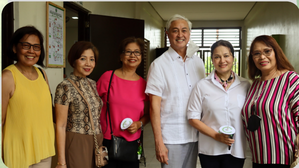
INAUGURATION AND BLESSING OF THE NEW HIGH SCHOOL BUILDING