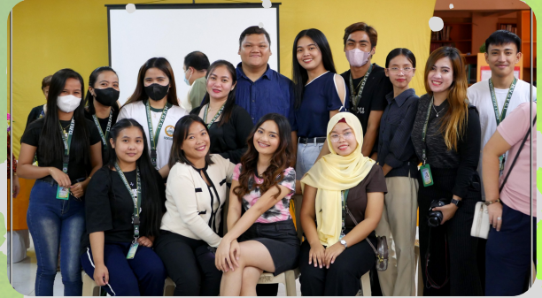
FUTURE MENTORS SOCIETY